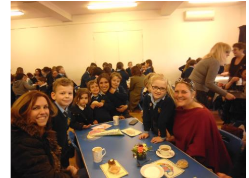
Tea and coffee was served by each child