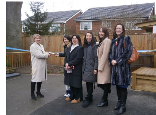
On Saturday members of the PTA helped our Chair of Governors cut the ribbon to officially open the new classroom and outdoor area