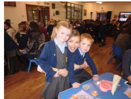
For some lucky Mummies there Was more than one cake!