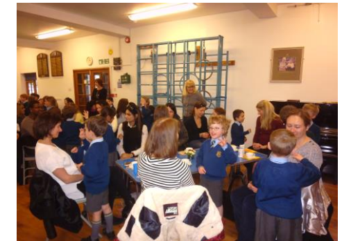
The children sang 'Love is Something' to their delighted Mummies.