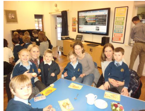
Mothers arrived to a name place Mat hand decorated by their child