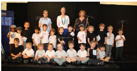
Our young chimney sweep Upper Nursery boys charm the audience as they 'Step in Time'

Following the success of last week's summer production, Race Against Time, the children have swapped costumes and props for running shoes and PE equipment as we have prepared for this year's annual Sport's Day. We have enjoyed practising for the relay races. It is a wonderful opportunity to work together as a team but enjoy some healthy competition too. We have dedicated this page to some reminders of our Nursery stage stars which I am sure will brighten your day.