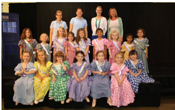
Upper Nursery Girls dazzled us with their Suffragette's chorus in the scene celebrating the year women got the vote