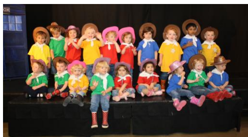
Lower Nursery remind us about the power of friendship with their rendition of 'You've got a friend in me'.