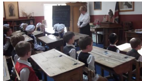
Sitting and listening with hands behind backs