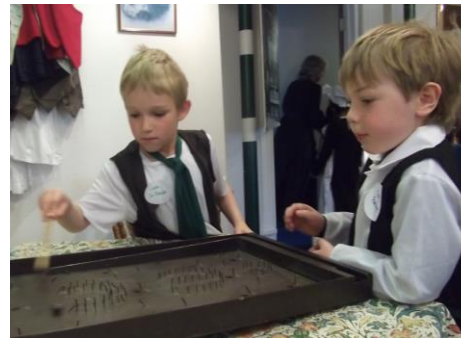
Using marbles for pinballs!

A day in the life of a Victorian child for Year 1 children