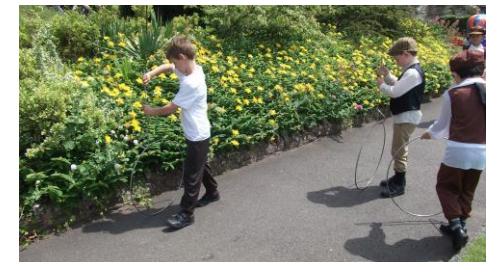
Rolling metal hoops in the sun