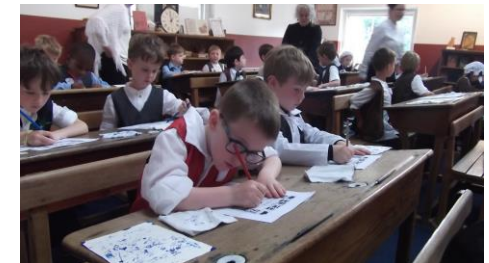
Using ink pens and blotting paper