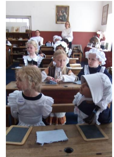
Drawing a still life owl on slate