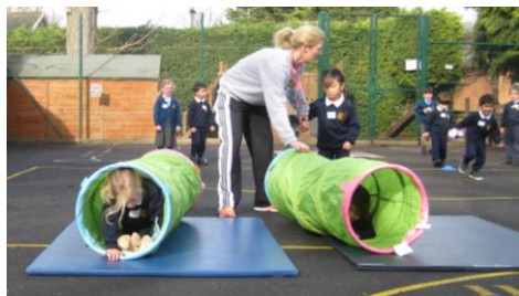
The Foundation Stage Team