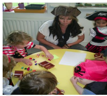
The counting treasure game

The lucky Reception children had a great adventure on a Gruffalo hunt at Gatton Park. They followed the tracks to find a snake, then a fox and an owl. Then....there he was the Gruffalo! After a delicious picnic lunch they collected colourful leaves and flowers to create a colour pallete. Later they explored their senses some more making a 'smelly cocktail' of leaves and herbs. They all had a great time but were very tired at the end of their busy day.