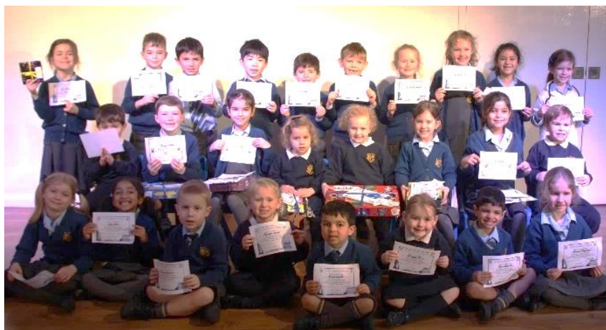
The Poetry Finalists this year