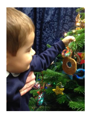
Decorating of the Christmas Tree