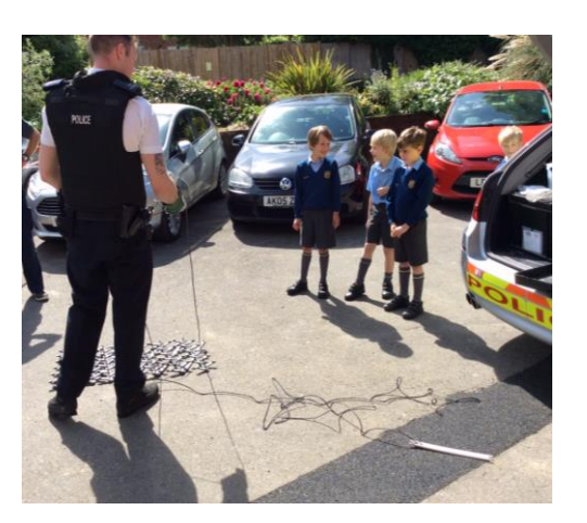
The children being shown a stinger after they had climbed into the car