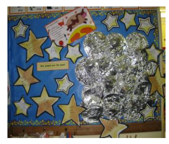
Reception moon made from foil and pasta

The Nursery Rhyme in Nursery this week has been Humpty Dumpty. We started with the story of how Humpty wanted to climb on the wall but the Kings Horses and the Kings Men told him 'No, Humpty you will fall.' The children were shocked to see that Humpty was a REAL egg and could not be put back together again! We looked at the inside of an egg and talked about the yellow yolk and the gloopy albumen. Later in the week we looked at a boiled egg that did not break easily!