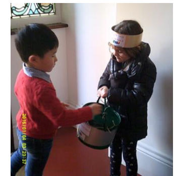
The school Council raising extra awareness for MERU together with an extra £325.98 proceeds from the Christmas Fair bucket