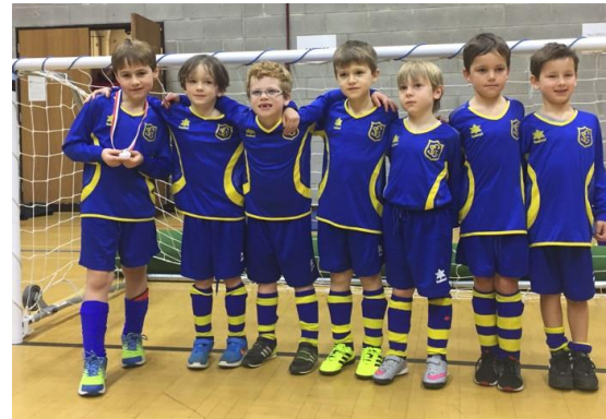
Our magnificent 5 a side tournament squad

For leading her School Council Team and adding a substantial amount of her own pocket money to the total.