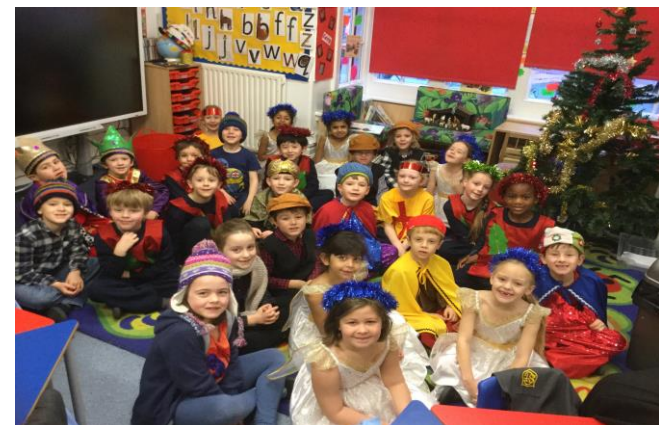
Year 2 getting ready to dazzle on stage in The Magic Jigsaw