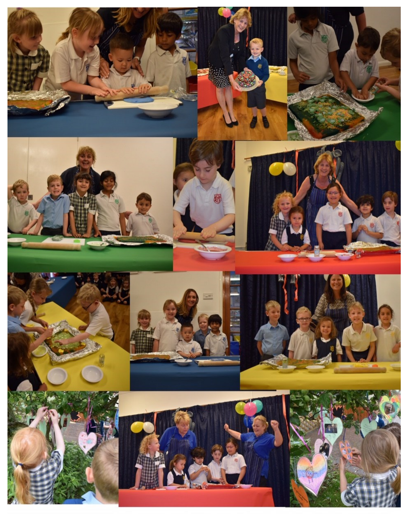
Elephant's Tea Party