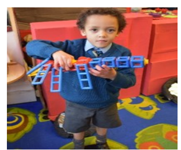
The Foundation Team