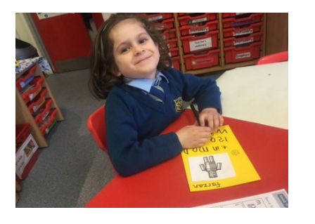
The Foundation Team