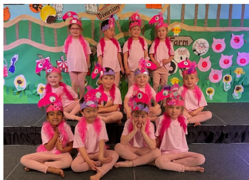
The Foundation Team